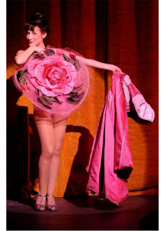
Gypsy - 2011