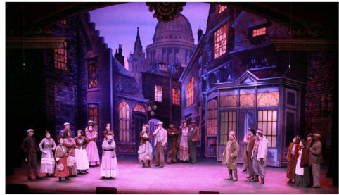
My Fair Lady - 2010