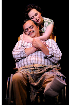
The Most Happy Fella - 2012