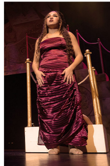
Aida - 2023