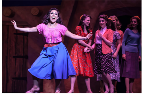
Too Many Girls - 2013