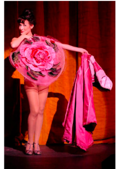
Gypsy - 2011