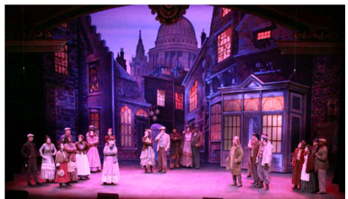
My Fair Lady - 2010