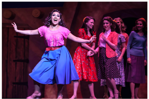
Too Many Girls - 2013