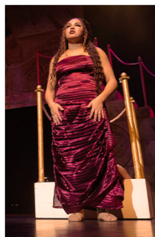
Aida - 2023