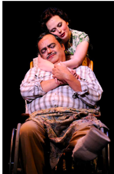
The Most Happy Fella - 2012