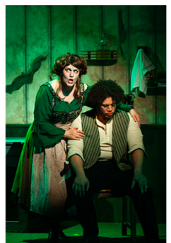
Sweeney Todd - 2024