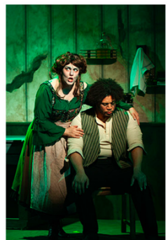
Sweeney Todd - 2024